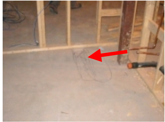
Digital Photo of Same Location: leak at arrow